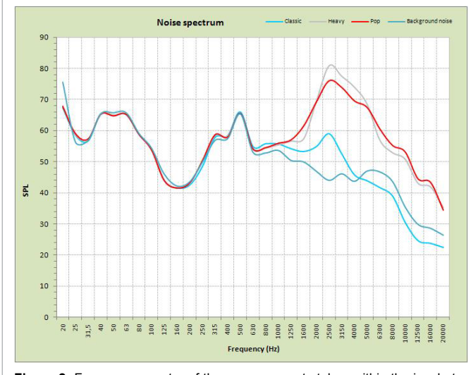
Figure 2: Frequency spectra of the measurements taken within the incubator for the three different music styles and the background noise. Sound pressure level (SPL) is measured in decibels (dB).

Table 2: Chart to calculate the embryo score, showing the morphologic parameters assessed and their weight on the final score.