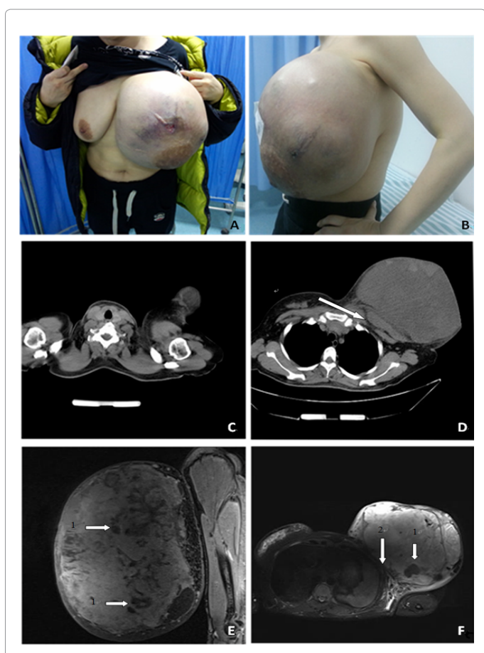
Figure 1: (A) Anterorview of the breast tumor on presentation to our clinic: (B) Lateralview of the breast tumor on presentation to our clinic; (C.D) CT showed the chest wall was not involved (indicated by arrow (E,F) MR showed the giant tumor accompanied by multiple cystic part (indicated by arrows 1). Boundaries are still clear between the giant tumor and pectoralis (indicated by arrow 2).

Breast phyllodes tumor (cystosarcoma phyllodes), originally described by Johannes Muller in 1838, is a rare space-occupying lesion of breast. In the past, physicians used cystosarcoma phyllodes to name this difficultly classified tumor. Because of the tumor's fleshy