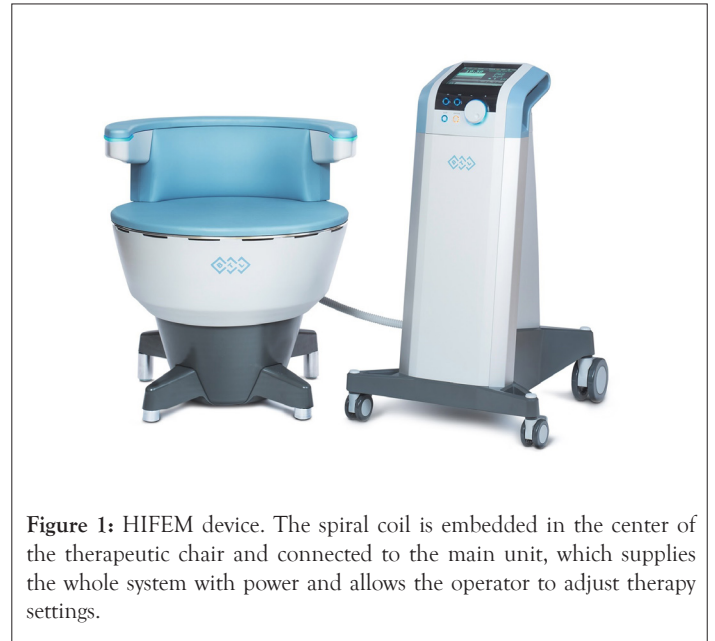
Figure 1: HIFEM device. The spiral coil is embedded in the center of the therapeutic chair and connected to the main unit, which supplies the whole system with power and allows the operator to adjust therapy settings.

to note that the lower the score the better QoL. The obtained results were compared to the baseline and statistically analyzed by a two-tailed paired t-test with the level of significance set as 5%. The Shapiro-Wilks test for normality verified the normality of data.