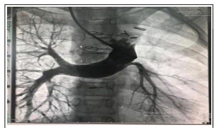
Figure 5: Control angiography 1 year after surgery, no stenosis in fontan anastomosis and fenestration spontaneously closed.

One patient had partial graft thrombosis 3 months after discharge. The patient was hospitalized and a 1-week medical treatment was performed. The patient was discharged as the symptoms regressed. In addition, cardiac functions were seen well on echocardiography. In the postoperative 1-2 year echocardiographic follow-up of all patients, the functional single ventricle ejection fraction value was measured as 63.4 \pm 10\% (p=0.085). NYHA capacity of the patients was evaluated as 1 or 2. Postoperative findings of all patients were shown in general (Table 3).