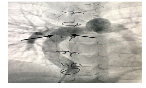
Figure 4: Edema findings around the eyes and in the body after 1 year in the patient who underwent Fontan surgery.

While 13 patients could be discharged within 7-12 days, discharge in 4 patients varied between 15-35 days due to effusion due to prolonged chylothorax. There were no patients who needed hemodialysis with renal dysfunction. No mortality was observed in the near term after discharge. Outpatient follow-up of all patients was done at 3-month intervals. One year after the operation, signs of peripheral edema were observed in the areas around the eyes and in the lower extremities in 2 patients (Figure 4).