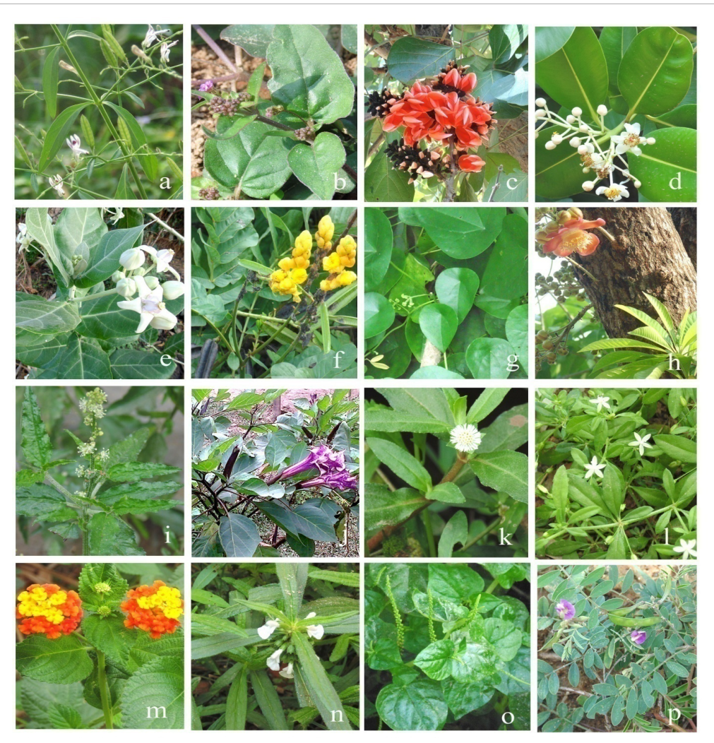
Figure 2: (a) Andrographis paniuclata (Burm. f.) Wall. ex. Nees. (b) Boerhavia diffusa L. (c) Butea monosperma (Lam.) Taub. (d) Calophyllum inophyllum L. (e) Calotropis gigantean R. Br. (f) Cassia alata L. (g) Cissampelos pareira L. (h) Couroupita guianesis Aubl. (i) Croton sparsiflorus Morong. (j) Datura metel L. (k) Eclipta alba L. Hassk. (l) Glinus oppositifolius (L.) A.DC. (m) Lantana camara L. (n) Leucas aspera (Wild.) Link. (o) Peperomia pellucida (L.) Kunth. (p) Tephrosia purpurea (L.) Pers.

of skin disorders. Moreover, these reports differ in the parts of the plant used or in preparation and mode of use. For instance, bark of Achyranthes aspera is used by the people of Gujarat for skin diseases (itching) [33]; root paste of Cassia fistula and whole plant extract of Eclipta prostrata is used for skin disease by Tribals of Bankura Districts, West Bengal [34]; Cissampelos pareira root paste is used by the people of Villupuram district of Tamil Nadu for wound healing and skin disorders [35]; fresh and dried fruits of Phyllanthus emblica is used by the people of Assam and Manipur for the treatment of skin diseases [36]; whole Plant of Tridax procumbens is used by the inhabitants of Varanasi, Uttar Pradesh for boils, cuts and wounds, eczema and skin disorders [37]. Similarly, various workers have reported the effective use of several herbal remedies for skin ailments and have confirmed potentials for Acalypha indica and Plumbago zeylanicum [38], Amaranthus spinosus [39], Buchanania lanzan [40], Ficus religiosa [41], Flacourtia indica [42], Michelia Champaca [43] and Solanum nigrum [44]. External applications are more preferred for the management of skin disorders [19]. Of the reported growth forms, herbs make up the highest proportion of the medicinal species. Literatures on medical ethnobotany explain the potential use of herbs for the treatment of