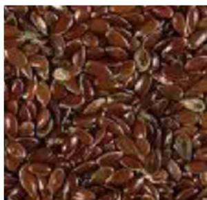
Figure 1: Flax Seeds.

Flaxseeds have a hard shell that is smooth and shiny and the