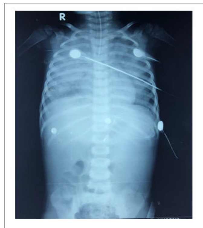
Figure 1: Chest X-ray revealing bilateral diffuse infiltrates.

revealed extensive SAH with occipital bone fracture. There was no evidence of any cardiac congenital anomaly or heart disease (Figures 1 and 2) [3].