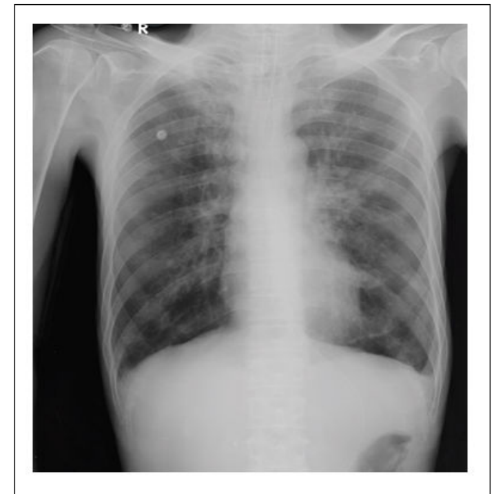
Figure 3: Bedside chest x-ray revealing bilateral hyperinflated lung fields with bilateral pulmonary edema.

Following intubation, white frothy sections were noted in ETT and extensive B/L rales were heard over chest. Repeat chest x-ray was suggestive of frank bilateral pulmonary edema. Patient was put on Mechanical ventilation PSIMV requiring initial PEEP of 15 and PC of 24-26 to generate Tidal volumes of 350 ml which was eventually tapered. He was managed on IV diuretics and positive pressure ventilation. He was eventually weaned off ventilator and discharged (Figure 3) [5].