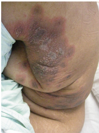
Figure 1: Left flank with erythematous targetoid plaques with dusky centers; forming areas of confluent erythema and coalesced tense vesicles.

An 80-year-old woman with celiac sprue presented with an acute bullous eruption on the bilateral flexural forearms. She had coincident onset of diarrhea and vomiting which led to dehydration, renal failure,