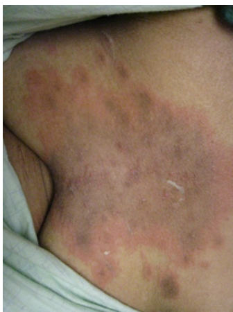
Figure 2: Central chest with erythematous targetoid plaques with dusky centers; forming areas of confluent erythema.