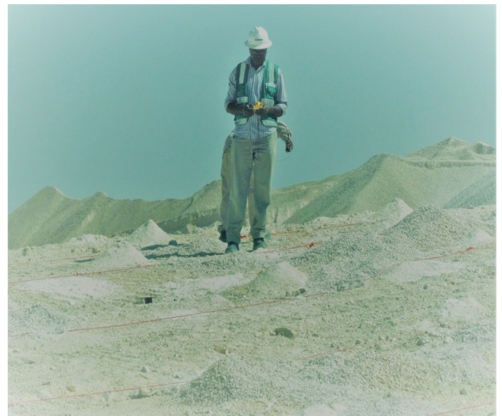
Figure 6: Measuring the electrical resistance of single bridge detonators using an Ohmmeter.

The electrical resistance of each was measured to make sure of its continuity (Figure 6). This blast design involved a lot of squatting,