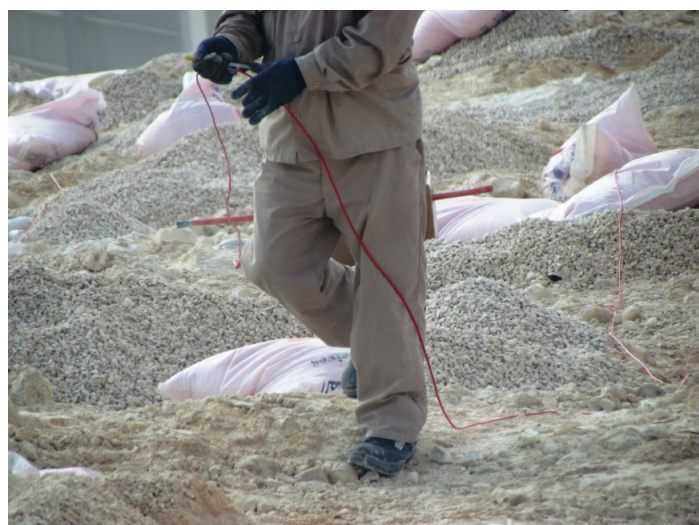
Figure 5: Holding and pulling 10 g/m detonating cord.

The electrical resistance of each was measured to make sure of its continuity (Figure 6). This blast design involved a lot of squatting,