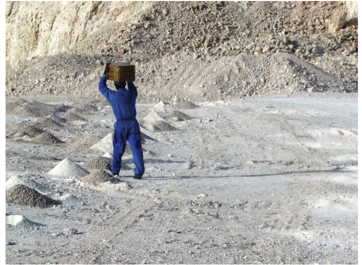
Figure 2: Carrying a 25 kg carton of emulsion cartridges.