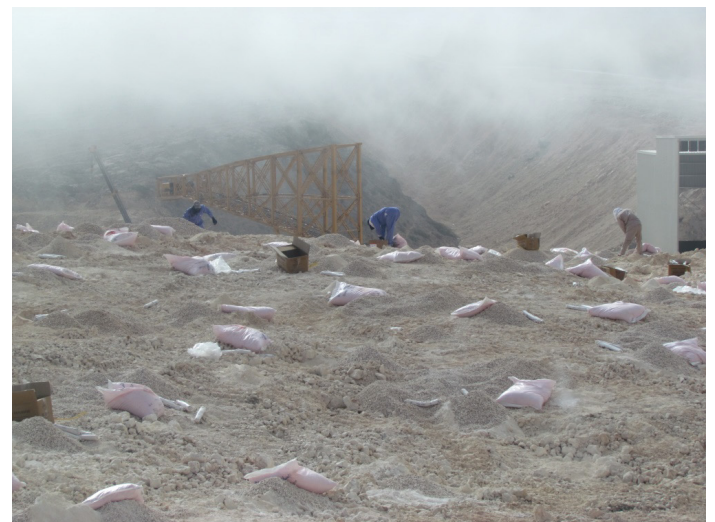
Figure 1: Crouching to prime the blast holes under a misty atmosphere.

Majan Mining Company is involved in the quarrying of Limestone in the Uyun Mountain range, west of Teetam, near Salalah in the Dhofar region of Southern Oman. The company produces crushed limestone in size range of 02-120 mm and also crushed ore below 2 mm. The quarry situated about 1250 m above sea level is divided into two sections; an older quarry with its pit in the west (Q1); and