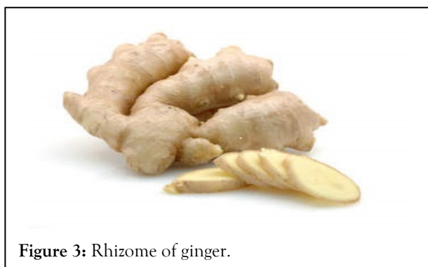
Figure 3: Rhizome of ginger.

Zingiberaceae known as ginger family is consumed worldwide as a flavoring agent and medicine for thousands of years. In Ayurveda, ginger has been used as a carminative, sweat-inducing, anti-seizure, and blood circulation stimulator for the treatment of inflammation and rheumatoid arthritis. The main medicinal value of ginger is due to gingerol and shogaol which have potent antioxidant activity. In addition, it contains zingerone and some oily resin called gingerin. It has been shown that ginger could have a good effect in menstrual irregularities treatment and can inhibit ovarian cancer cells. Furthermore, some studies showed that ginger could enhance fertility index, serum testosterone level, testis and seminal vesicle weight, sperm motility, count, and quality and enhance male fertility in rats (Figure 3).