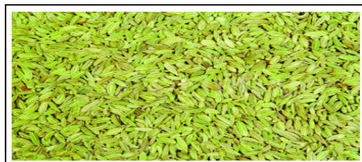
Figure 4: Fennel seeds.

increased the serum progesterone level and endometrial thickness of PCOS (Figure 4).