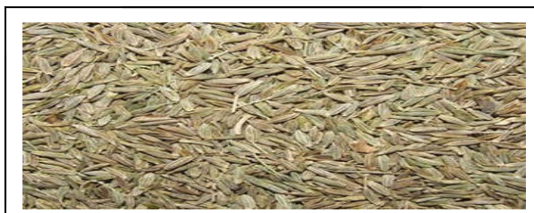
Figure 2: Cumin seeds.

Zingiberaceae known as ginger family is consumed worldwide as a flavoring agent and medicine for thousands of years. In Ayurveda, ginger has been used as a carminative, sweat-inducing, anti-seizure, and blood circulation stimulator for the treatment of inflammation and rheumatoid arthritis. The main medicinal value of ginger is due to gingerol and shogaol which have potent antioxidant activity. In addition, it contains zingerone and some oily resin called gingerin. It has been shown that ginger could have a good effect in menstrual irregularities treatment and can inhibit ovarian cancer cells. Furthermore, some studies showed that ginger could enhance fertility index, serum testosterone level, testis and seminal vesicle weight, sperm motility, count, and quality and enhance male fertility in rats (Figure 3).