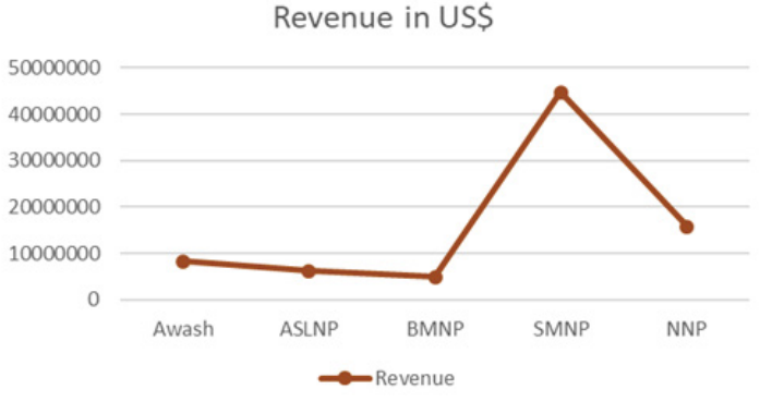
Figure 4: Government revenue from tourism in some PAs of Ethiopia in 2015/16.