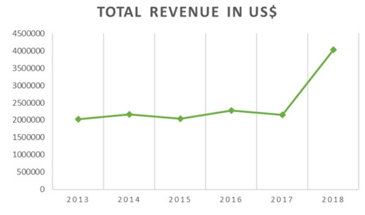
Figure 5: Direct total government revenue from wildlife resources between 2013 and 2018.

income including hunting, concession fees, filming fee, research fees and other royalties. The data from EWCA wildlife utilization directorate shows that the total direct revenue to government has shown significant growth, increased from more than $2 million in 2013 to more than $4 million in 2018. There is lack of documentation in many PAs to demonstrate the direct income generated to local communities from other income generation activities such as temporary employment and labor (Figure 5).