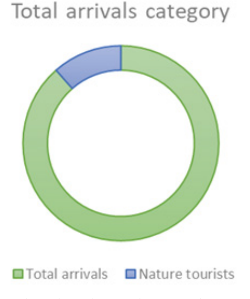
Figure 2: Total arrivals to Ethiopia and its protected areas in 2017/18.

According to The International Ecotourism Society (TIES), report the concentration of natural assets of a given destination determines the development of nature tourism in a particular region (TIES, 2003). Although the nature tourism has shown positive growth yet accounts only 13% of foreign tourists in Ethiopia whereas domestic nature tourists are very trifling compared to religious travellers. These domestic nature group are characterized by Scientific, Academic, Voluntary and Educational (SAVE) travellers' mainly dominated by students. The Ministry of Culture and Tourism reported the average daily spend of international visitors to Ethiopia is about $161 [20]. International tourist's length of stay have a varied range in PAs due to the availability of various tourism products within PAs. The Simien Mountains National Park (SMNP) and Bale Mountains National Park (BMNP) are advantaging the landscapes in developing trekking routes for hiking the steeply mountains thus, average length of stay in these PAs is longer than other PAs known with lack of advanced tourism products. In general we assume international tourists averagely spending two days for nature tourism activities. Thus, our conservative overall expenditure of nature tourists is estimated more than $58.5 million in 2017/18 (Figure 2).