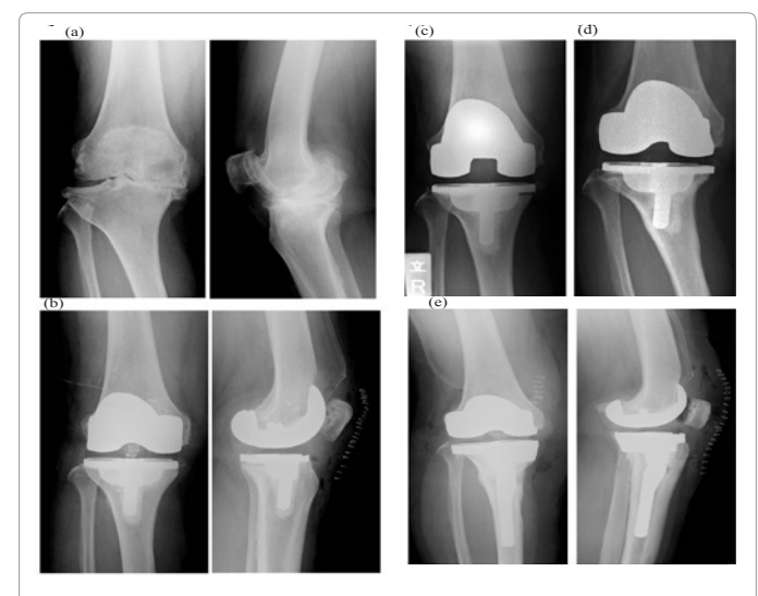
Figure 1 Case 1. (a) Plain radiographs taken prior to primary TKA surgery. (b) Plain radiographs taken after the primary TKA surgery. Tibial component was implanted with 4 degrees of varus and 4 degrees of posterior slope.(c)Three months after primary TKA. Radiolucency below the tibial component was clearly observed. (d) Eight months after primary TKA. A sinking of the tibial component and varus deformity had occurred. (e) Approximately 2.5 years after initial TKA, tibial component revision was

a radiolucent area below the tibial component was apparent on the follow-up radiograph (Figure 1c), and 8 months after the operation, sinking of the tibial component was obviously confirmed. At that time, FTA was 187 degrees (Figure 1d). Although we observed her clinical