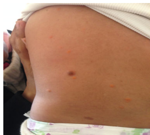
Figure 2: Orange papules well limited, firm, infiltrated, rounded to oval.