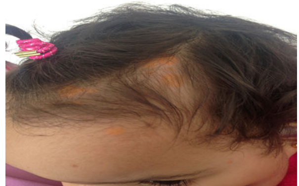
Figure 1: Orange papules in the face.

JXG is the most frequent Non-langerhansian histiocytosis (NLH). It usually occurs in infants and children in 80% of cases before the age of 2 years [1]. The lesions preferentially sit at the level of the upper part of the body but may also appear at the limbs. It is characterized by a single papule or a single yellow-orange nodule [2]. The JXG is rarely multiple which makes the originality of our observation. We should distinguish between the micro-nodular form which is the most frequent, and the macro nodular form that could have a particular risk of systemic involvement (lung, bones, kidneys, testicles, pericardium, eye, etc.).