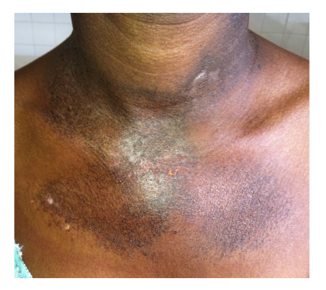
Figure 2: Showing hyperpigmentation of sun exposed area.

The cutaneous manifestations in decreasing frequency order were: Hyperpigmentation of sun exposed areas in all cases; symmetric erythema of sun exposed existing in 93.7% of the cases, edema of the face or the extremities present in 56.7% of cases. Poïkilodermatous lesions were observed in 25% of cases. The less common cutaneous manifestation was telangiectasia, observed in one case representing 6.2% of the cases (Table 2). The precession of cutaneous manifestations on muscular manifestation was observed in 100% of patients (Figure 2-3).