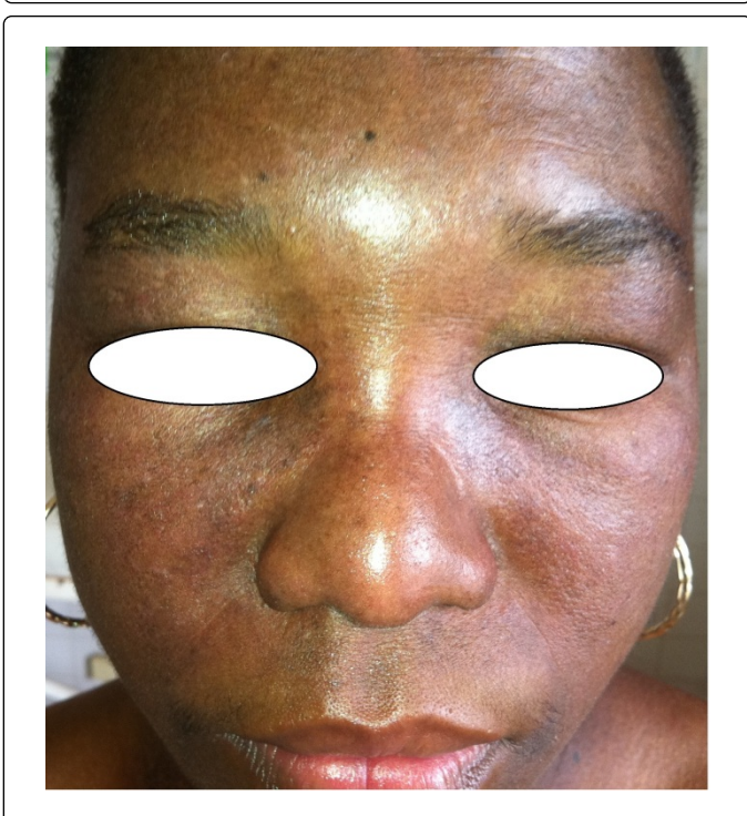
Figure 3: Showing oedema of the face.

Estimated by disease history and the follow-up, the average delay for occurrence of muscular symptoms after the onset of cutaneous symptoms was 1 month. The longest delay was 4 months. All cases had at least proximal muscles weakness. In all cases the muscular manifestations were observed in pelvic or scapular muscles. Muscle weakness was noted in all cases. Muscular fasciculation was noted in 6 cases representing 37.5% of cases Because of this weakness, none of the cases was able to resume a normal activity during the period of follow-up. Three cases representing 18.7% of cases had dysphagia sign of