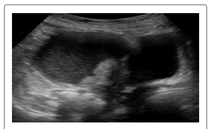
Figure 3: The abdominal ultrasound -a tumor mass inside of the uterus.

The second case: I present other clinical case of a woman 47 years old in menopause from 2 years, who started the same therapeutic scheme-menopausal hormone therapy replacement with androgen therapy replacement-Lutenyl 5 mg-1 drug/day during three weeks. After this period of time start the first menstrual cycle (induction cycle) and after that for maintain the menstrual cycles she continue the therapeutic scheme with estrogen therapy Cycloprogynon 2 mg-1 drug/day continuum. The menstrual cycle was present once per month with duration five days like a physiological cycle, but after 20 weeks of administration appeared a severe bleeding, with clots, duration of 14 days and it can't be stopped with anticoagulant therapy. After hospitalization and an abdominal ultrasound put in evidence a tumor mass inside of the uterus (Figure 3) and endometrial biopsy was performed this confirm the diagnosis of endometrial carcinoma (Figure 4) and the women must to perform total hysterectomy and bilateral removed of the ovaries.