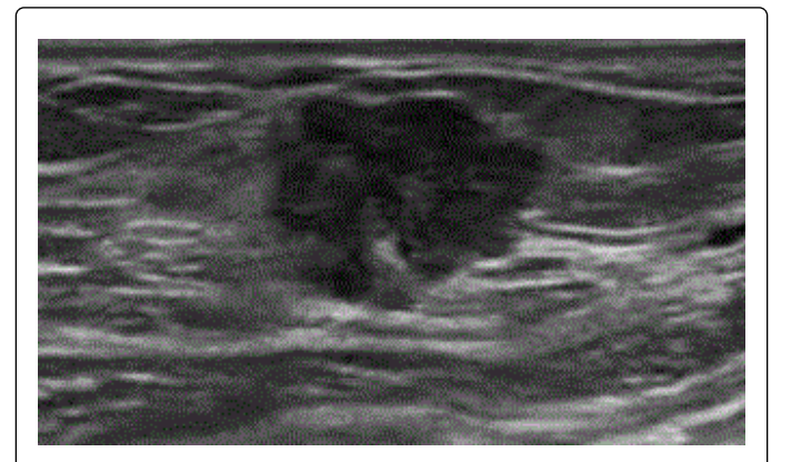
Figure 1: The breast ultrasound- tumor mass 3.5/4.5 cm, irregular borders.

The woman, indeed can mention the menstrual cycles with estrogen therapy replacement-one cycle per month like a physiological menstruation, but after six month of this hormonal therapy observed apparition of a tumor formation in the breast, with dimensions ¾ cm, irregular borders, increase consistence and painful. For this reason she performs immediately a breast ultrasound (Figure 1). This examination confirm safe the presence of a tumor mass inside of the breast, with dimensions 3.5/4.5 cm, irregular borders and without enlarge lymph nodes present in the both axils. The patient refused to perform a mammography, because of irradiation and also refuse the biopsy puncture of the tumor mass.