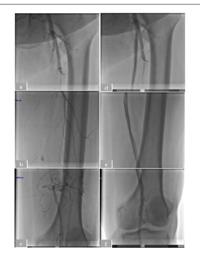
Figure 1a-c: Angiography shows totally occluded superficial femoral artery. d-f: End result after balloon angioplasty.

Table 4: The results of 1ry & 2ry patency rates for different lesions in non-diabetic group.