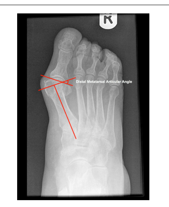
Figure 5: Distal metatarsal articular angle

Akin group (-4.67 mm). There is no statistical significance between the two groups in changes to the foot width (p=0.30) (Figures 5 and 6).