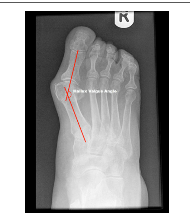
Figure 1: Hallux valgus angle

corrective osteotomy of the proximal phalanx, to proximal fusion of tarsometatarsal joint. However, the contemporary operative hallux valgus corrections typically involve the use of first metatarsal osteotomy of variable techniques dependent on the severity of the hallux valgus deformity. Additional procedures are used in combination to further correct deformities, these include lateral soft tissue release, relocation of sesamoids, Akin osteotomy, and various capsulorraphy techniques [4,5].