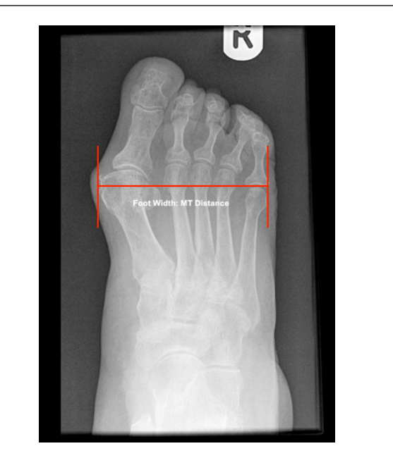
Figure 6: Foot Width: Metatarsal distance