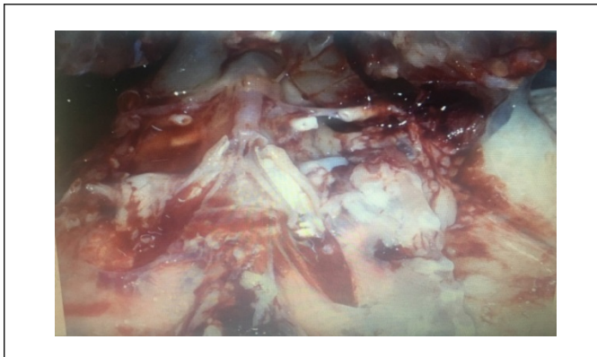
Figure 1: Cheesy material in bifurcation of bronchi.

material in bifurcation of bronchi as shown in Figure 1 as well as urethras were distended with uric acid crystal.