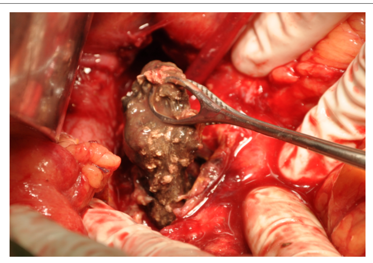
Figure 2: Open conventional necrosectomy.

Of the 29 patients, 18 (group A) were operated with conventional open necrosectomy through the gastrocolic ligament using blunt and water-jet techniques (Figure 2).