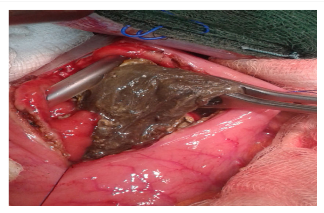
Figure 3: Open transgastric necrosectomy.

The necrosectomy was performed bluntly with water-jet technique. In these patients, a nasogastric tube was inserted into the cavity site after necrosectomy. The retroperitoneal spaces were also necrosectomized in all cases.