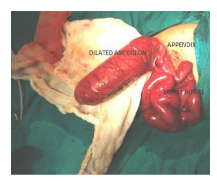
Figure 2: The proximal dilated caecum, ascending colon resected.

flown out of anus suggesting distal patency (Figure 2). In view of size disparity proximal ileostomy and distal mucus stoma of the transverse colon was made. Newborn recovered well and started on oral feeds on 3<sup>rd</sup> postoperative day. Ileostomy stoma functions well, and healthy. Newborn is planned for definitive procedure of ileocolic anastomosis during later date.