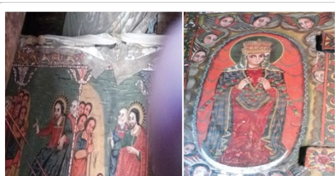
Figure 7: Wall paintings of Zuraba Monastery.

Besides more than 1600 years history, Zuraba Monastery, the home monastery of Zemarie- Mewasit School, is also rich in priceless heritages. According to Yenta Fenta (interviewed on March 20/2017), some of those heritages are Abune Aregawi's hand cross, gold painted staff (Mequamia) and chair, Saint Yared's hand cross, staff(Mequamia) and sistrum, Atse Tewodros' hand washing pot(sen), queen zewuditu's and Etegie Menen's gold umbrella, silver cross (Afro