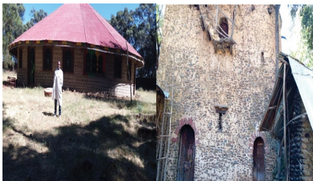
Figure 5: Qoma Fasiledes church.