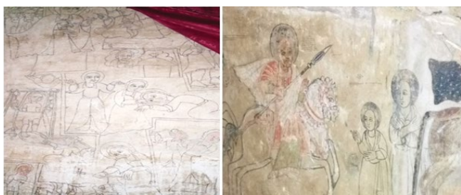
Figure 6: Wall paintings of Qoma Fasiledes Church.

aygeba), and a book of the glory of martyrs, which cannot be moved by a single person.