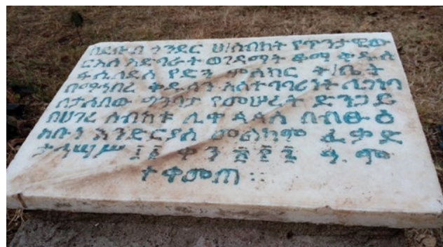
Figure 4: stepping stone for constructing students' dormitory and teaching Hall at Qoma Fasiledes church school.