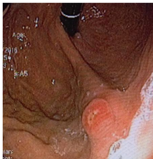
Figure 2: Cameron lesions, into the hiatal hernia.

The treatment is divided into medical and surgical, however it is recommended that first line therapy should be with PPI and prokinetics, surgery should be reserved for refractory cases. The therapy supplementary oral iron is made in cases presenting with concomitant anemia. The most Cameron lesions patients will have disease problems associated with gastroesophageal reflux disease, esophagitis and peptic ulcer. So they already have inhibitor therapy acid secretion, however in these circumstances should be intensified therapy for healing of these lesions. Surgical treatment, as mentioned above, it is reserved for refractory cases to medical treatment, massive