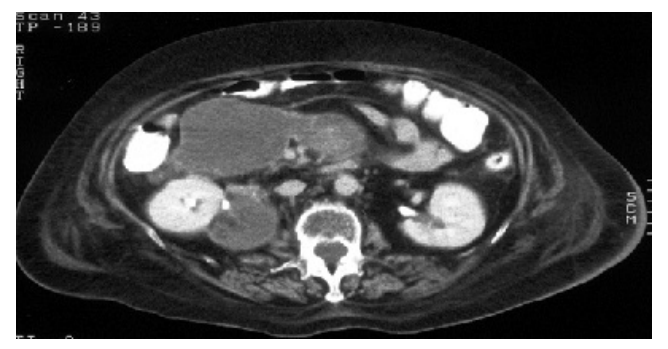
Figure 2a: Pancreatic pseudocysts observed in the sixth week after the onset of acute pancreatitis.

collections (Figure 2a) was performed guided by CAT-scan, and enteral nutrition was reinitiated via a long nasojejunal feeding tube.