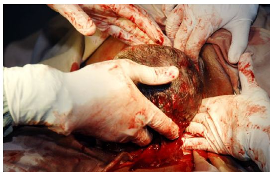
Figure 6: Proper force out position of shoulder of infant.