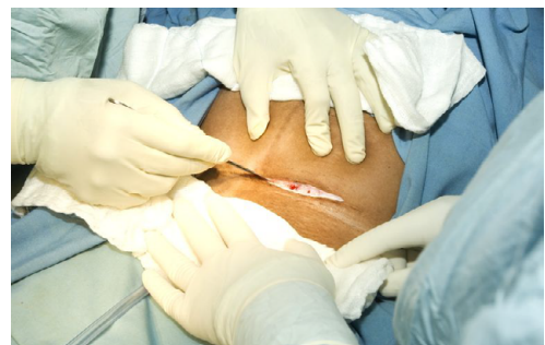
Figure 2: Beginning of c-section.

So this is all the process of caesarian and its steps, process involved in it.