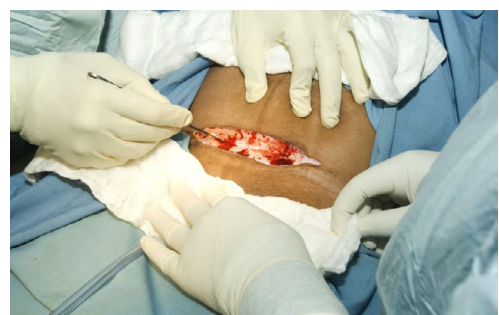
Figure 3: Incision at multiple layers on the womb.