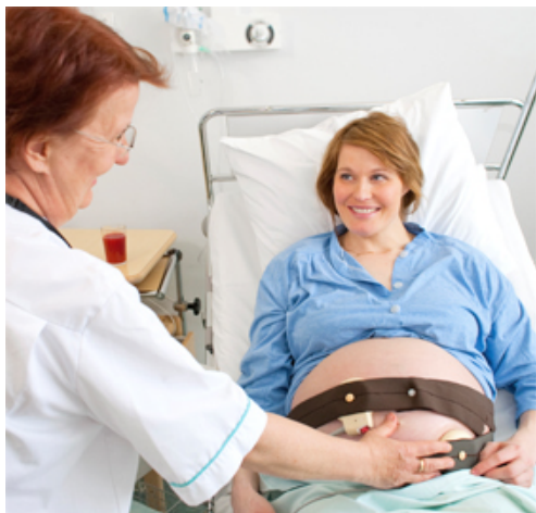
Figure 1: Explaining of the caesarean section to mother before anaesthesia.