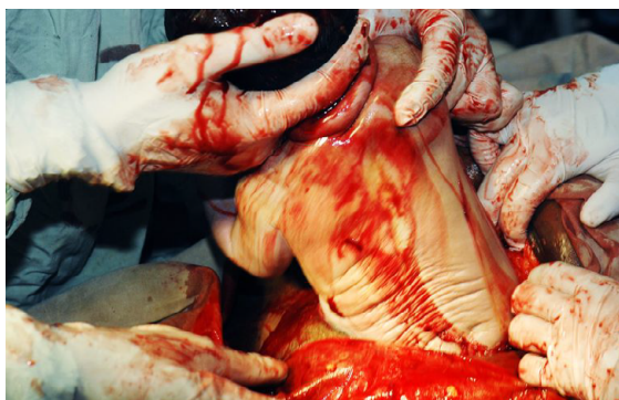
Figure 7: Complete look out of baby body from womb.