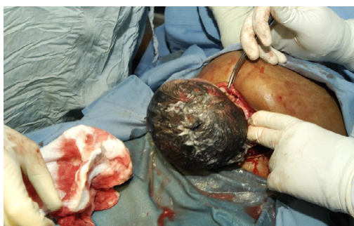
Figure 5: Smooth dealing in baby head outs.