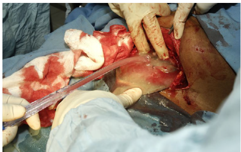
Figure 4: Draining of amniotic fluids through tubes.