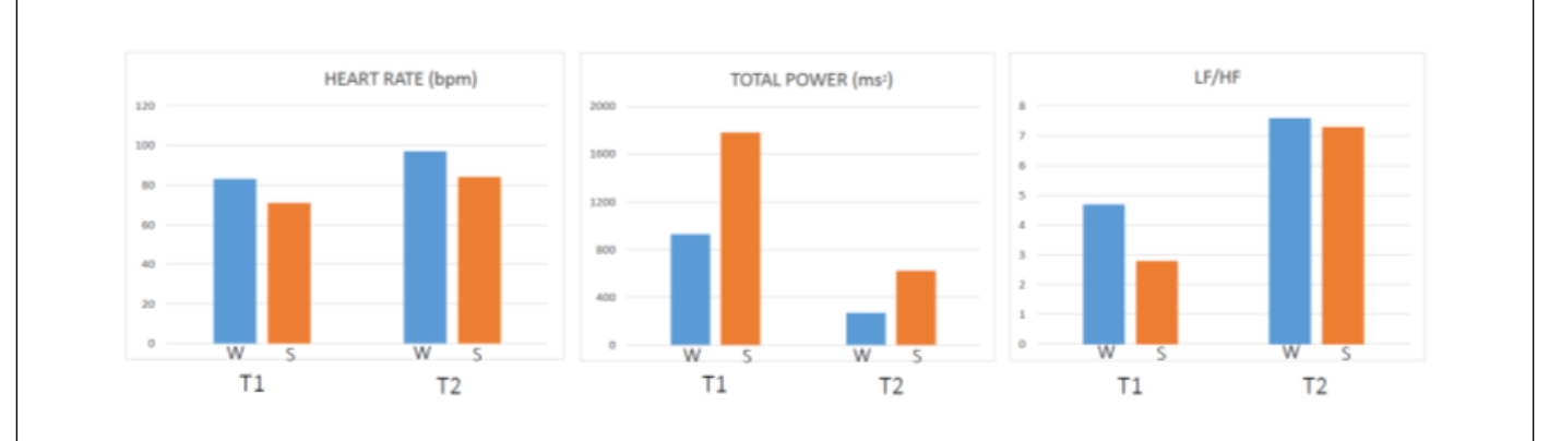
Figure 3: Comparing T2 to T1, both during W and S, a reduction of total variability and a predominant sympathetic modulation is observed. As to sleep analysis, total power increased from W to S at T1 and T2. A predominant sympathetic control during wake is present in both recordings.

increased of VLF component. A predominant parasympathetic modulation during sleep and a predominant sympathetic control during wake were present in both recordings (Figure 3).