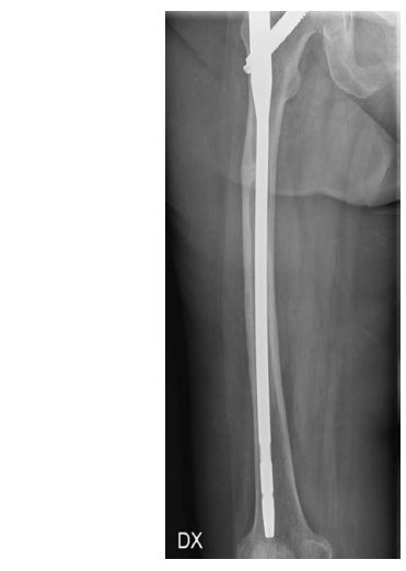
Figure 9: Fracture at 6 month post-op

6. Reduced vascularity and anti-angiogenic effect.