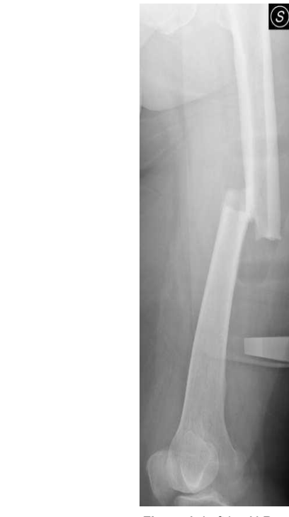
Figure 1: Left leg X-Ray

The American Society for Bone and Mineral Research (ASBMR) task force suggested several possibile pathogenic mechanisms [7]: