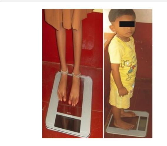
Figure 1: Weight measurement technique.

Kuppuswamy's classification (Modified) for Socio-economic status of urban population (Tables 3 and 4) [13].