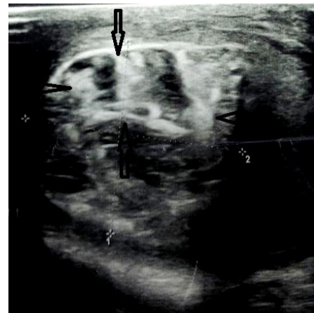
Figure 1: Ultrasonography of the Scrotum: showing smaller right testis with hypoechoic pattern and complex heterogenous hyperechoic lesion within the testicular capsule (arrow).

Angiomyolipoma is a rare benign tumor, presents in women over 50 years of age, which mainly involves the kidneys and 20% associated particularly with tuberous sclerosis. This tumor is consisting of thick-walled blood vessels, smooth muscle, and adipose tissue [2]. It was initially regarded as a form of hamartoma, but today is considered to be a tumor derived from perivascular epithelioid cells, which can affect