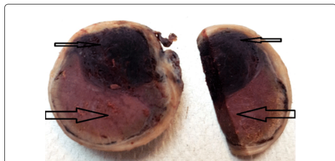
Figure 2: Photograph showing: The testis measured (4x3x3cm). A hematoma and necrosis was identified on cutting (short arrow), while the rest of the testicular tissue appeared pale and hard, AML of the testis (long arrow).