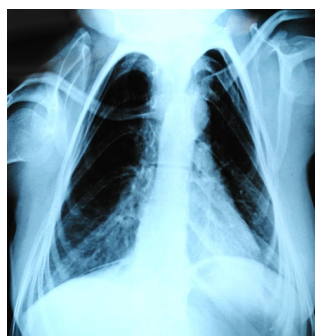
Figure 4: AP view of thorax showing deviation of trachea and marked kyphoscoliosis of thoracic spine.

Intravenous line was secured with 18G cannula. Inj. Ringer lactate was started. Inj ranitidine 50 mg and Inj metoclopramide 10 mg were given by slow i.v. Injection. Monitors were attached to the patient. Preop vitals: NIBP: 130/86 mmHg, pulse: 88/min, SPO 2 : 98% on room air. Under all aseptic conditions, subarachnoid block was given in left lateral position at L3-L4 space using 25G quincke needle with 1.4 ml inj bupivacaine 5% heavy.