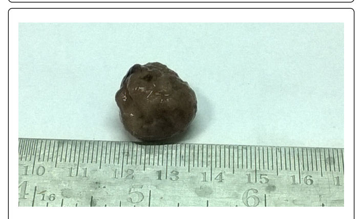
Figure 3: Macroscopic appearance of the polyp after resection.

Few cases of Gastric polyp mimicking hypertropic pyloric stenosis in infancy have been reported in literature [5]. In infancy haematemesis as a presentation of polyp is rarer; so far only one case was reported whose sole presentation was haematemesis [6]. Present case has a significant hematemesis to drop her haemoglobin to 6.5 gm.