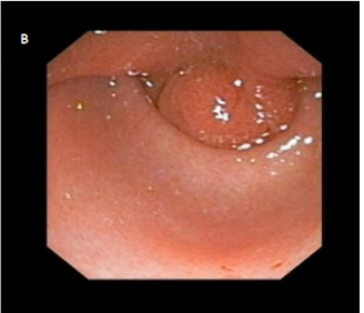
Figure 1A and 1B: Endoscopic appearance of Gastric Polyp.

Initially an endoscopic polypectomy was planned but in view of a wide stalk in a 5 month old baby a decision of laparoscopic polypectomy was taken. On laparoscopy a wide stalked antral polyp was found which was removed. Histopathology showed the features of hyperplastic polyp. The infant recovered very well post operatively and started feeding from breast from 2nd day and was discharged on 3rd day.