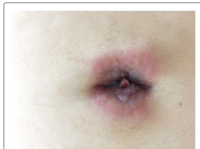
Figure 1: Reddish and firm umbilical nodule (Sister Mary Joseph's nodule).

The umbilical cutaneous metastasis of visceral tumors is rare, they are known as "the Mary Joseph's nodule". Herein, we report a new case of an umbilical nodule revealing a metastatic colon adenocarcinoma.