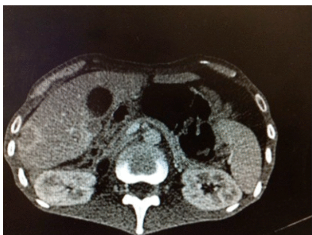
Figure 4: CT thoraco-abdominal-pelvic: Peritoneal carcinomatosis with hepatic metastasis.

The clinical presentation is an indurated and irregular painless nodule, with variable diameter (typically less than 5 cm), often with a vascular appearance. The surface can be fissured or ulcerated with hemorrhagic, mucinous, serous, or purulent discharge. The histological findings confirm the diagnosis of an adenocarcinoma in 75% of cases, rarely squamous cell carcinoma, and undifferentiated cancer or carcinoid tumors. Primary neoplasms have usually an abdominoperineal origin (ovarian, endometrial, cervix, pancreas, and biliary tract, gastrointestinal or genitourinary tumors). Nevertheless, in 10-30 % of cases, the primary tumor remains unknown. Till now, there isn't a well-defined consensus on treatment. However, surgery combined with a chemotherapy treatment have improved survival [3,4]. Mary Joseph's nodule have a poor prognosis, the average survival after the onset of umbilical metastasis is about six months [3].