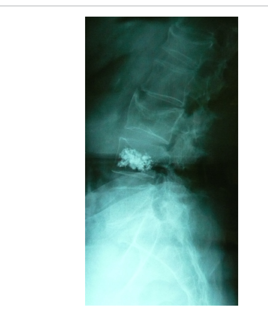
Figure 2: A lumbar osteoporotic vertebral fracture in a 75 years old woman treated with vertebroplasty: the body is filled of PMMA, antibiotic and barium, during a fluoroscoply-controled procedure.