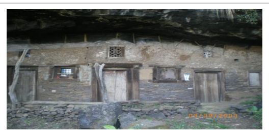
Figure 2: This is the Cave of Endrias.