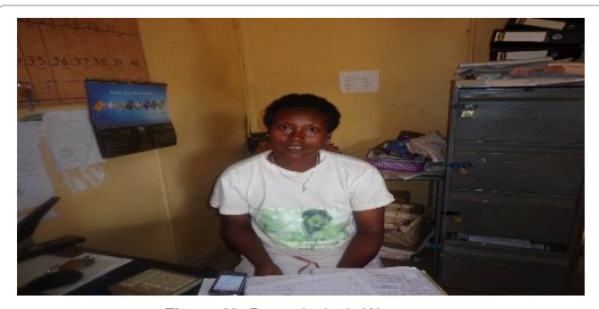
Figure 19: Receptionist in Wanzaye.