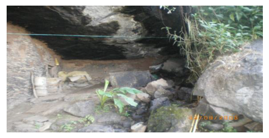
Figure 3: The roof of the cave