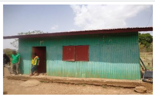
Figure 18: Information Desk in Wanzaye.