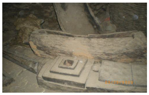
Figure 4: The soak used for splashing the blood.