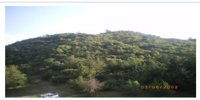
Figure 13: Natural forest in Wanzaye