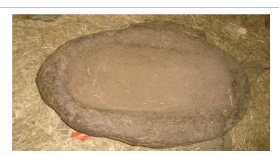
Figure 5: The rock slate for presenting the sacrifice.

your trip of the site is also unsatisfactory for the reason that there is no information desk in the cave as well as in the town nearer to the cave. Nevertheless, the people who administer the church are willing to give you a tour in the church as well as provide you the information you need about the cave.