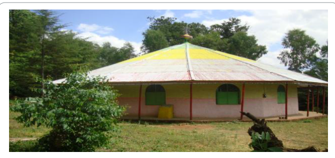
Figure 9: AbuneAwstatiwoch males' monastery.

Like the above discussed historical heritage sites, there is an absence of resort for spending a good nightlife and entertainment in this site too. The reason for the absence of a place to spend a good night life and entertainment in this site is similar with the above ones.