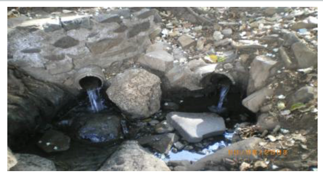
Figure 12: Main source hot main spring water.