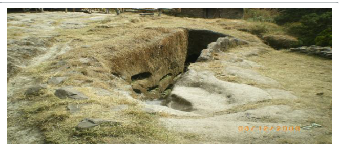
Figure 10: The entrance of Wekro Medhanialem church.

The fastest impression someone can make when he or she visits this place is the hospitality of the people in the precinct. The attitude