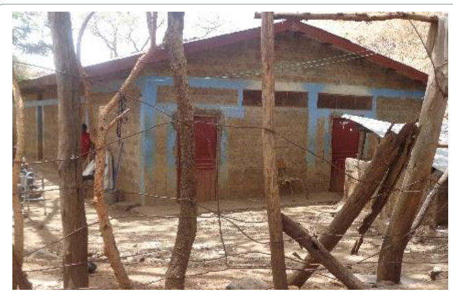
Figure 15: Hot natural spring family bath.