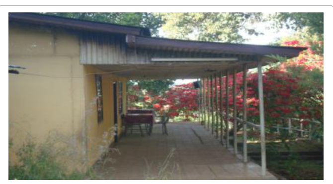
Figure 16: Hotel in Wanzaye.

people who came to this place because the place was surrounded by a tree called Wanza . Those people said "I saw a plant (wanz)" which literary means "ዋንዛአየሁ" in Amharic, and the place was named after this incident 'Wanzaye'. According to the chronicles recorded, elderly people used to live in this place, and one man came to this place in search of his lost ox. When this man arrived at this place, he found the pieces of his ox's flesh and bones. Then this man accused and killed the monk who used to live at this place for eating the flesh of the dead ox. Finally, vultures spread the flesh of the monk around this place, and a holy water sprang out on the spot/ground where the flesh of the monk landed.