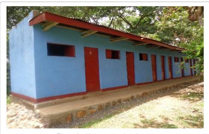
Figure 14: Hot natural spring shower.