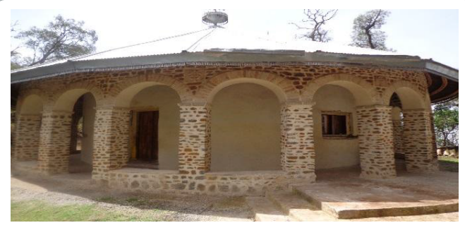
Figure 8: St. Mary's church females' monastery.