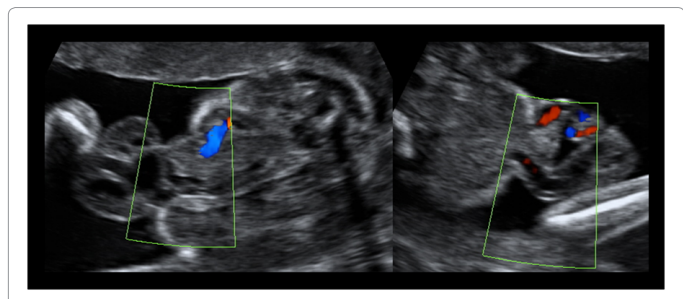
Figure 3: 23 weeks ultrasound. Bladder was not visible suggesting a prolapsed bladder

The differential diagnosis of this entity includes omphalocele and bladder extrophy. Karyotyping is not mandatory when this is an isolated finding, because of the lack of association between urachal anomalies and aneuploidy [12]. In this case, it was performed after parents' request.