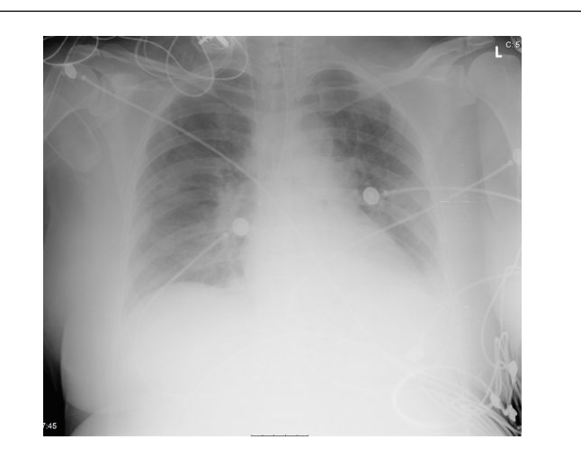
Figure 2: Chest X-ray two hours after treatment with lipid emulsion.

After hemodialysis, IV methylene blue 1 mg/kg, nitric oxide and IV glucagon 100 mcg/kg/min were added because of the low blood pressure and poor oxygenation, without any response. At this stage veno-venous ECMO support was initiated. Under this treatment, blood pressure increased in the following day and renal function gradually improved; urine output 40 mL/hr, serum creatinine 2.03 mg/dL and BUN 47 mg/dL. When blood pressure was stable at 140/80 mmHg (pulse 92 beats/min) the amines were discontinued.