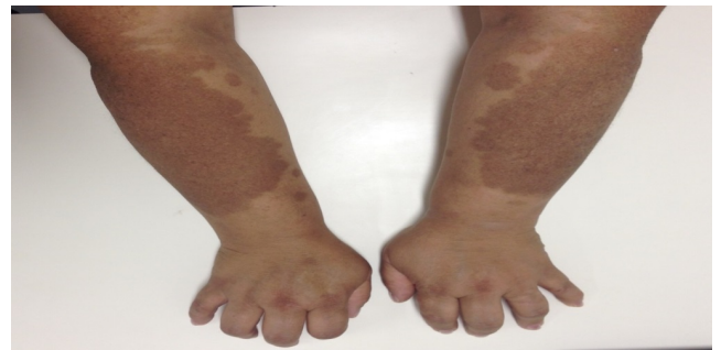
Figure 2: Brownish plaques appeared over the same areas.