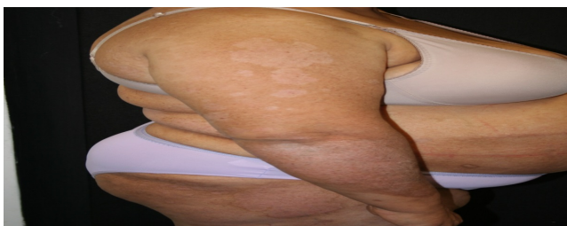
Figure 1: Brownish velvety plaques on the exterior surface of upper limbs, trunk and inferior membranes.

White, obese, hypertensive, diabetic and dyslipidemic 46 year-old female patient. The patient has also bipolar disorder and is currently taking metformin, propranolol, omeprazole, insulin, simvastatin, topiramate, amlodipine and fluoxetine.