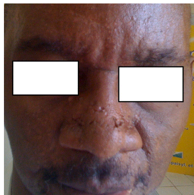
Figure 5: Clean et and repigmentation of the face

The histological examination of this ulceration was less specific but showed a polynuclear infiltration into the dermis and the epidermis, which was for neutrophilic dermatosis. The high and low digestive endoscopy did not show anything in particular. All these signs allow us to conclude to the diagnosis of pustular psoriasis of the face associated with a perianal pyoderma gangrenosum. Under corticotherapy (prednisone) in the dosage 1 mg/kg/day for pyoderma gangrenosum treatment, we observed normal cicatrization of the perianal ulceration, and then a progressive clearance of the all face was observed with a cutaneous reepithelization (Figure 5).