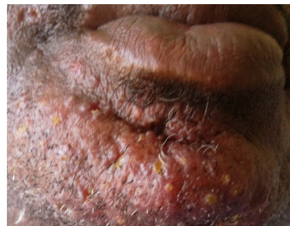
Figure 1: Pustulosis in barber

Mr. GG, 50 years of age, presented in 2003 a pustulosis in barber of the chin arising on erythematous skin which extended progressively to the front, to the head, to the nose, to the nasal and genus areas, in vespertilio aspect on the cheekbone and cheeks but the eyelids were normal (Figure 1).