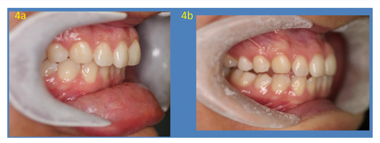
Figure 4: The dental occlusion before and after treatment. Prior to treatment (a) the horizontal overlap (overjet) of the anterior teeth is excessive, indicating mandibular retrognathia. After biomimetic oral appliance therapy (b) the anterior teeth are edge to edge, indicating antero-inferior repositioning of the mandible with no appliance in the patient's mouth.