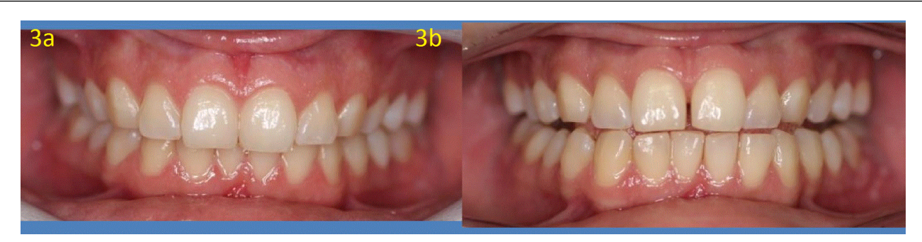
Figure 3: The dental occlusion before and after treatment. Prior to treatment (a) the vertical overlap (overbite) of the anterior teeth is 50% approximately. After biomimetic oral appliance therapy (b) the anterior teeth are edge to edge, indicating an increase in the vertical dimension of occlusion.