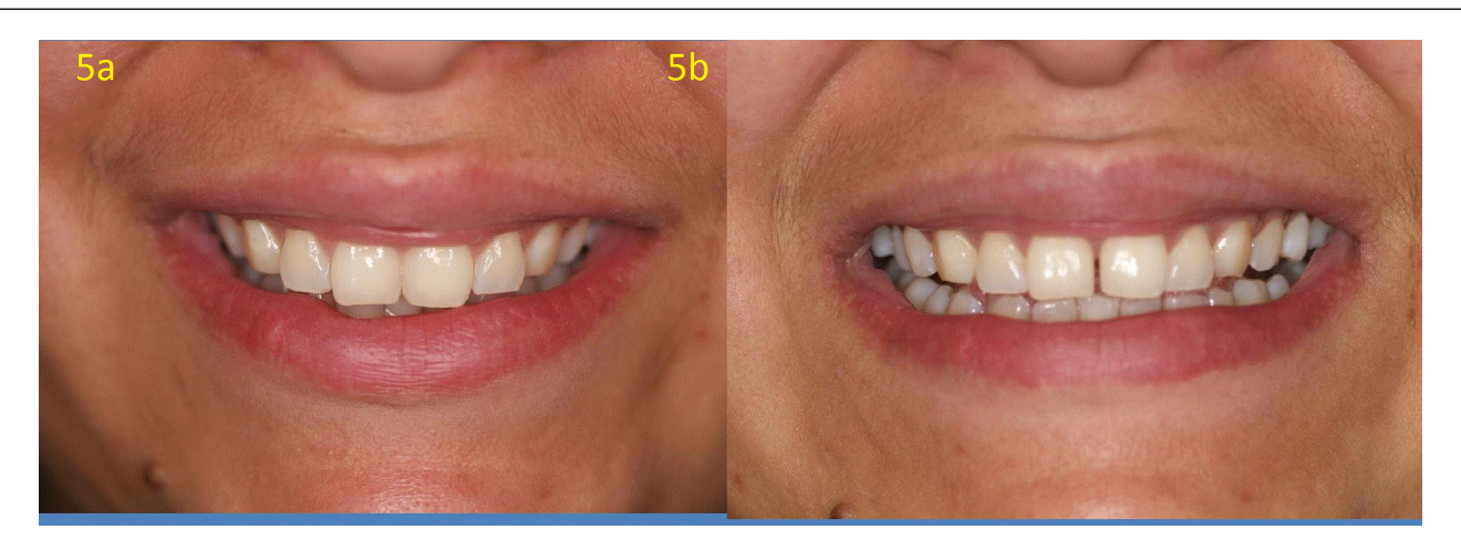
Figure 5: The smile esthetics before and after treatment. Prior to treatment (a) the patient has a narrow upper arch with lingual inclination of the upper teeth. After biomimetic oral appliance therapy (b) the patient exhibits broader smile esthetics.