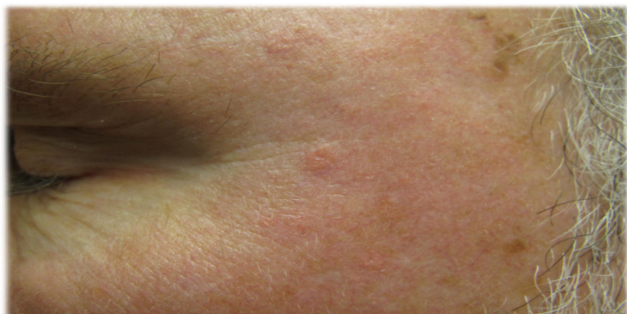
Figure 1: Pretreatment: enlarged yellow umbilicated papule on the left lateral orbit (sebaceous hyperplasia).

cooling device duration of 30/20 (spray/delay). For session 2, we used our novel treatment protocol to eliminate post-procedural purpura.