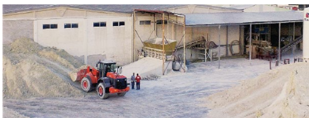
Figure 1: The photograph of sand and gravel industry.