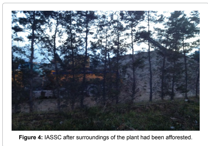
Figure 4: IASSC after surroundings of the plant had been afforested.

*Keep loading and unloading work at low levels.