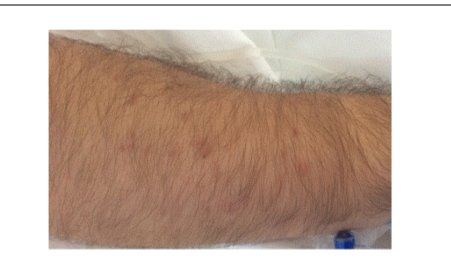
Figure 1: Papulonodules 4-8 millimeters to 1 cm reddish-brown lesions, affecting over upper limbs.

On physical examination, he had more than 100 firm, papulonodules fixed to the skin, ranging in size from 4-8 millimeters to 1 cm, reddish-brown in color, affecting only his upper and lower limbs (Figures 1 and 2). No other sites were affected and he had no mucosal lesions. There was no increase in erythema or edema when rubbed.