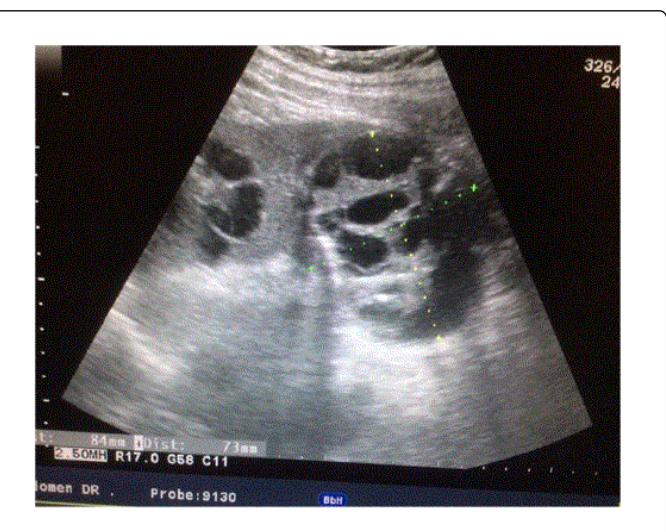
Figure 4: Two complicated cysts in the left kidney.

disappearance of the lesions with only post inflammatory hyperpigmentation remaining.