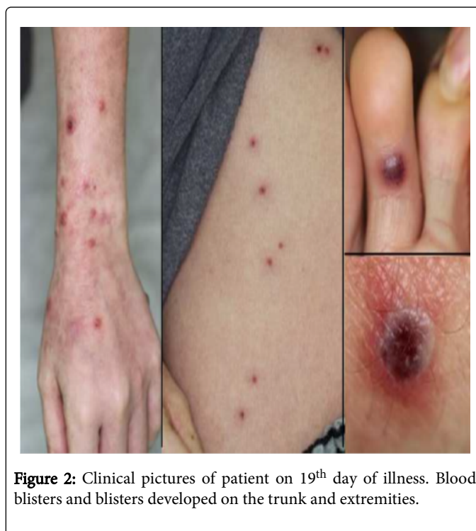
Figure 2: Clinical pictures of patient on 19 th day of illness. Blood blisters and blisters developed on the trunk and extremities.

was tapered or discontinued [9]; this occurred 3 years after the onset in one patient [2].