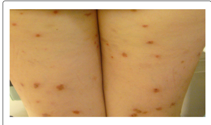
Figure 2: Clinical findings of new plaque on her thighs.

number of micro vascular in the dermis, and neutrophilic micro-abscesses (Figure 3).