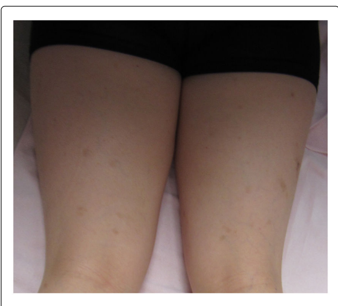
Figure 4: Clinical findings of her improved skin on the thighs.