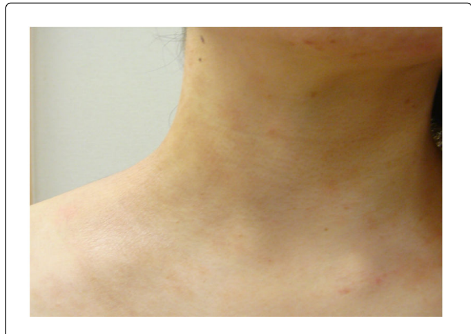
Figure 1: Clinical findings of atopic dermatitis on her neck.

A 43-year-old female developed AD (Figure 1) as a child, and new, round, light erythema with pigmentation, scaling, and itching has increased on her arms, thighs (Figure 2), and legs over 40 years. She has used steroid ointments for her atopic dermatitis, but her new plaque has increased.