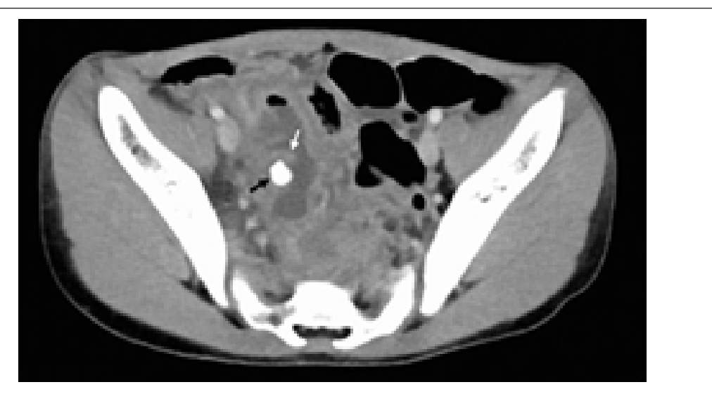
Figure 2: CT scan shows that a 9 years old boy got an acute perforated appendicitis with fecalith. The black arrow indicates the fecalith in the lumen of the appendex. The white arrow indicates that the appendix wall is thick and broken with abscess formation.