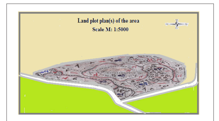
Figure 1: Land plot plan (s) of the areo the village Malham of the Shamakhi.

With an area of 2.8 hectares and on the EIA of Gyandja RUCN in the village and B/Bagmanli with an area of 4.45 hectares. It has been proven by the results of numerous experiments and researches, when choosing the right crop irrigation technology, it is imperative that we study the agro-soil, natural-economic, geographical relief of the territory and the degree of natural moisture and other characteristics based on the monitoring of multi-year data on the object of research, which we should study specified in the example of the Shamakhi region, where it was decided to set up experiments in the period 2007-2009 for which it is shown in the table. Water-physical and agro-chemical properties of the soil of the object of research, experiments that were carried out on the territory of the village Malham of the Shamakhi region. The results of our analysis showed that on the territory of the Shamakhi region widespread mainly degraded mountain brownish-brown soils are mainly widespread (Figure 1).