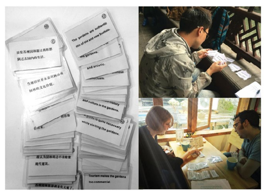
Figure 5: Q-sort cards in Chinese and English and the process of Q-sorting.

The 32 Q-sorts consisted of 20 female and 12 male tourists. 18 Chinese and 14 international tourists were included. In the category of 20s and 30s, it contained 10 participants each; in the category of 40s and 50s plus, 6 participants each did the Q-sort. 7 participants are full-time undergraduate and graduate students while 13 have occupations such as teacher and office worker, the rest of 2 are retired office worker and housewife. In addition, the majority of the P-set at least have a bachelor degree. In general, the P-set is relatively balanced in the demographic section as the researcher planned (Table 4).