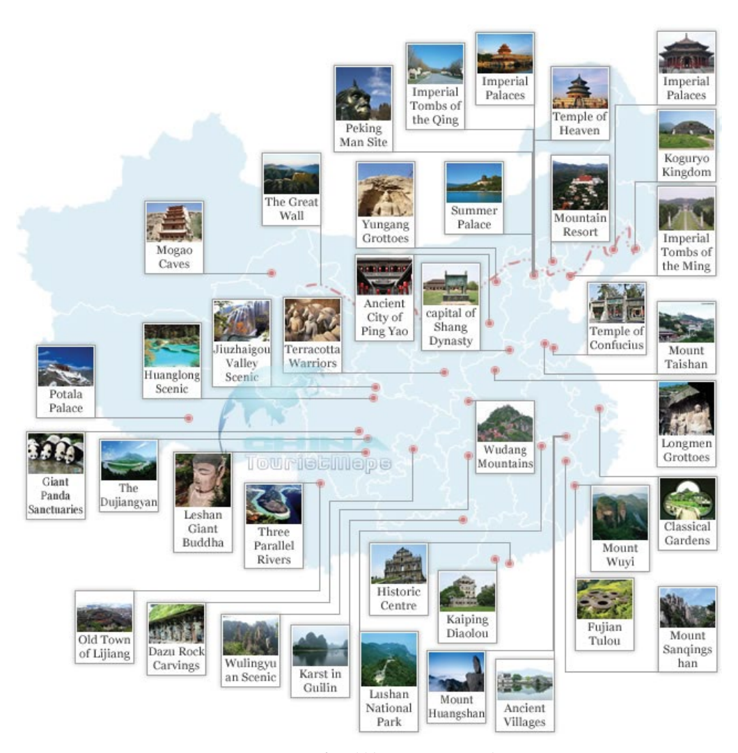
Figure 1: Map of world heritage sites in China.

Integrity and/or authenticity is/are the compulsory condition to meet when measuring OUV. The evaluation requirements of authenticity went through a long and tough period since 1978. The Nara Conference on Authenticity in 1994 became the most important conference in defining "authenticity". The Nara Document on Authenticity interpreted the term "authenticity" to: