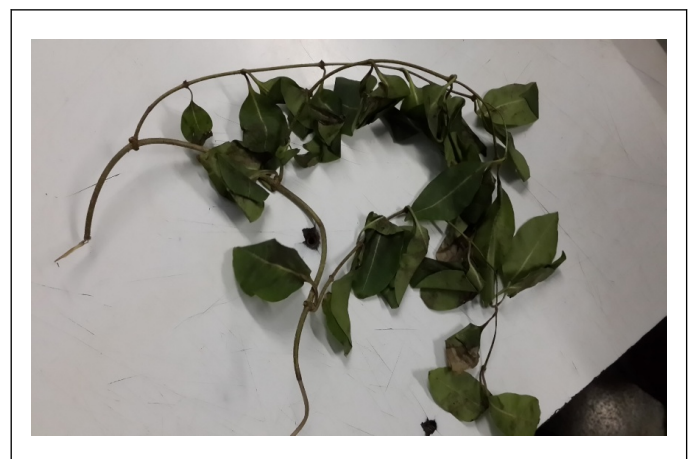
Figure 1: Plant leaves which were consumed by the patient.

A 45-year-old male presented to the emergency department with recurrent episodes of vomiting of one day duration. He had ingested a paste made up of leaves of a plant, which was given to him by a herbal medical practitioner as a treatment for his chronic skin condition. Leaves eaten by the patient are shown in Figure 1. On evaluation, he was conscious and oriented. His pulse was 48 per minute. The blood pressure was 100/70 mmHg. He had multiple scaly plaques all over the body suggestive of psoriasis. Examination of the heart, lungs and abdomen were normal. Neurological examination was also normal.