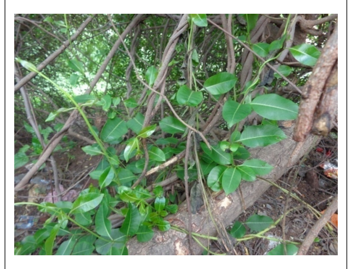
Figure 4: Field visit of Cryptostegia grandiflora.

This was initially managed as a case of yellow oleander poisoning. He was asked to procure the leaves of the plant which were different from that of yellow oleander. Later, field visit confirmed that the leaves were of the plant Cryptostegia grandiflora. He improved and was discharged from the hospital after a week. Field visit of Cryptostegia grandiflora is shown in Figure 4.