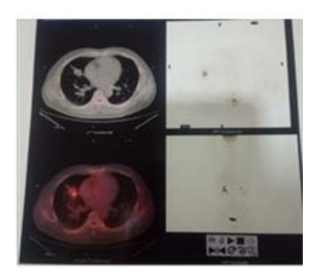
Figure 1: Primary tumor with metabolic activity (SUV=5.3) at the time of diagnosis as seen by PET-CT imaging.

Table 1: Treatments and tumor responses.