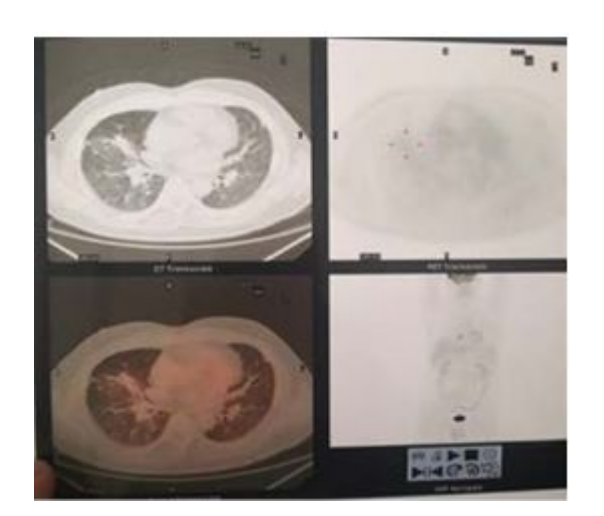
Figure 2: Primary tumor before surgery by PET-CT imaging (SUV=1.7).