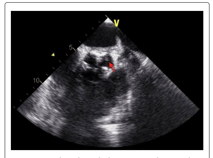
Figure 2: 2-D echocardiograph showing stenosed aortic valve in short axis view.

Figure 1: 3-D picture of normal Aortic valve and Rheumatic Aortic stenosed valve.