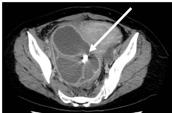
Figure 1: Computed tomography scan of the pelvis showing the fluid-containing right adnexal cyst, suggestive of an abscess. The arrow indicates the inserted catheter.

adhesiolysis. The enlarged uterus with the firmly adherent right adnexa was removed (Figure 2). Histopathological examination confirmed a tubo-ovarian abscess of the right fallopian tube and ovary and leiomyoma of the uterine corpus with necrosis. In her appendix, moderate infiltrations of leukocytes as well as histiocytes were found in serosa; however minimal neutrophils in muscularis propria were found, suggesting that this inflammation is caused by neighboring adnexa. The postoperative course was uneventful, and the patient was discharged in good condition on postoperative day 14. At 9 months' follow-up, no evidence of recurrent pelvic infection or other sequelae were found.